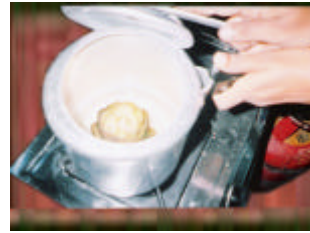
Remove it after cooking