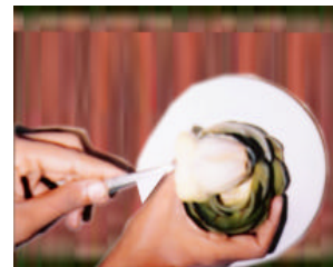
Scrape out the purple tipper leaves and fuzz present in the centre

Gently spread leaves until centre cone is reached