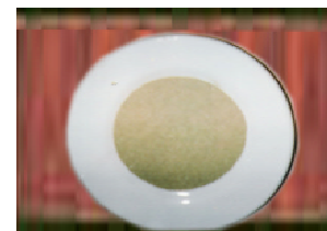
Dry and make it in to powder and store it