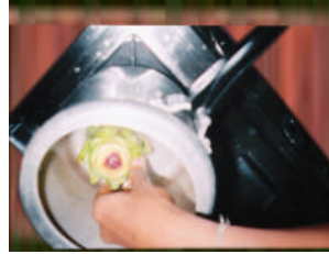
Keep inside the pressure cooker for 5 minutes