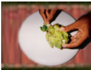
Pull of lower petals which are small and discolored

Gently spread leaves until centre cone is reached