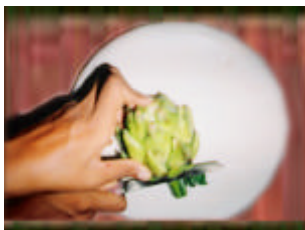
Cut stems close to base