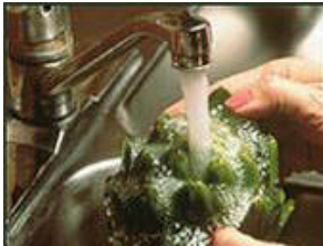
Wash globe artichoke under cold running water