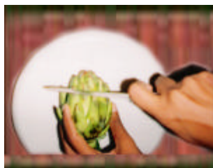
Cutoff top quarter and tips of petal which is thorny in nature