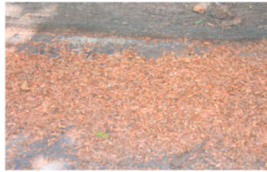
Fig. 3 (a): Fresh Prawn Waste (F.P.W)