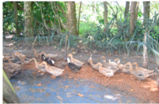
Fig. 3 (b): Ducks feeding on fresh prawn waste

farmers. Ectoparasiticide spraying was also not adopted. Pasteurellosis was the major disease causing huge mortality and economic loss to farmers. Farmers are looking for an effective vaccine against Pasteurellosis. Bumble foot was a common problem encountered in this system. The incidence of this condition was high due to the prick wound produced on the legs by the hard chitinous exoskeleton of the prawns. Egg production starts from 6 1 / 2 - months of age. Most of the birds lay eggs early in the morning by 5 A.M. Therefore, collection and marketing of egg was very easy. Eggs were collected daily at 6.30 A.M and stored up to 2-3 days at room temperature. These eggs were sold to the middlemen who supply the duck to the farmers. There are few farmers who practice direct marketing and they make more profit than others. Local people relish duck egg and there is a huge demand for eggs in the domestic market. So the eggs are not exported outside the state.