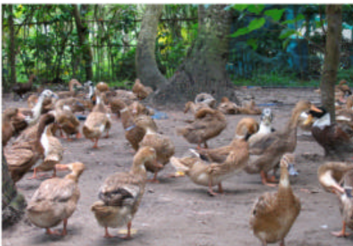
Fig. 2 (b): Ducks on the free range