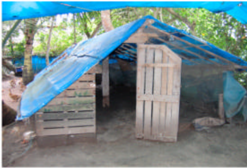
Fig. 2 (a): Night shelter for ducks